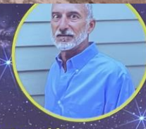
Collegewide Distinguished Alumnus

Nicole Stott '92MS Retired Astronaut NASA