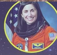
Collegewide Distinguished Alumna